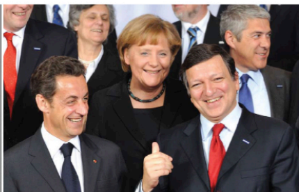
A TURNING POINT FOR THE PLANET? French President Nicolas Sarkozy, German Chancellor Angela Merkel and Danish Prime Minister Lars Løkke Rasmussen (left to right) after the Copenhagen Climate Summit.

France renounces the climate summit, says delegates and leaders. The deal was a victory for the market. The deal was a victory for the market.