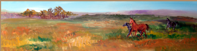
Three wild horses running from man in open field Brian Lee Gazes