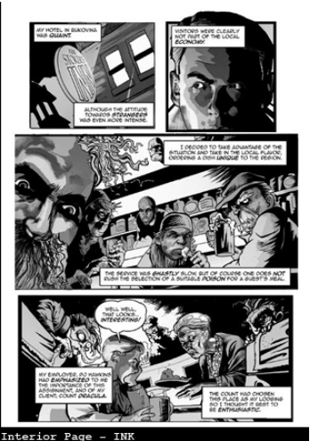
DRACULA Graphic Novel - Published 2011