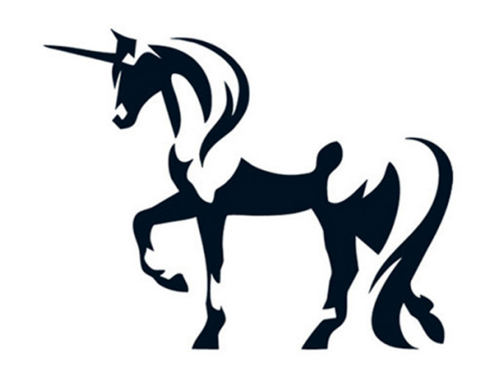
Illustration 10 Edmund street Australia