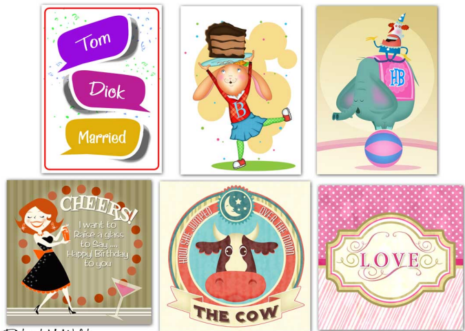
Richard H. Walsh Client: Various holiday greeting cards Project: design and illustrate holiday greeting cards and some text Duties: Design, illustrate

View the full portfolio at http://www.thecreativefinder.com/richhwalsh