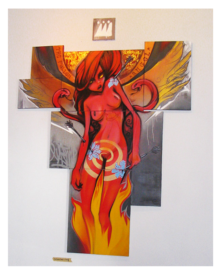
Illustration Vancouver BC Canada