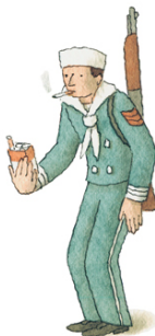
1943 NAVY SEABEE PORT HUENEME