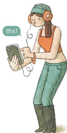
2014 TEENAGER THE OAKS MALL