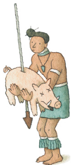
1638 CHUMASH TRIBESMAN PASO ROBLES