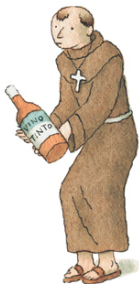
1786 SPANISH MISSIONARY SANTA BARBARA