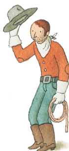
1890 COWBOY SANTA PAULA