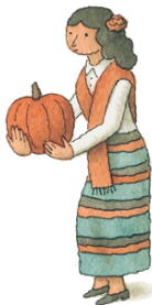
1853 RAMONA RANCHO CAMULOS