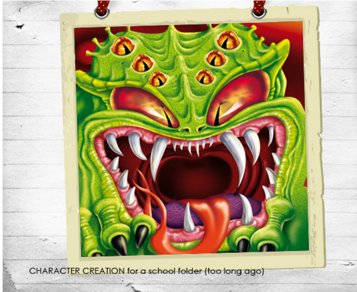
CHARACTER CREATION for a school folder (too long ago)

View the full portfolio at http://www.thecreativefinder.com/egletarditi