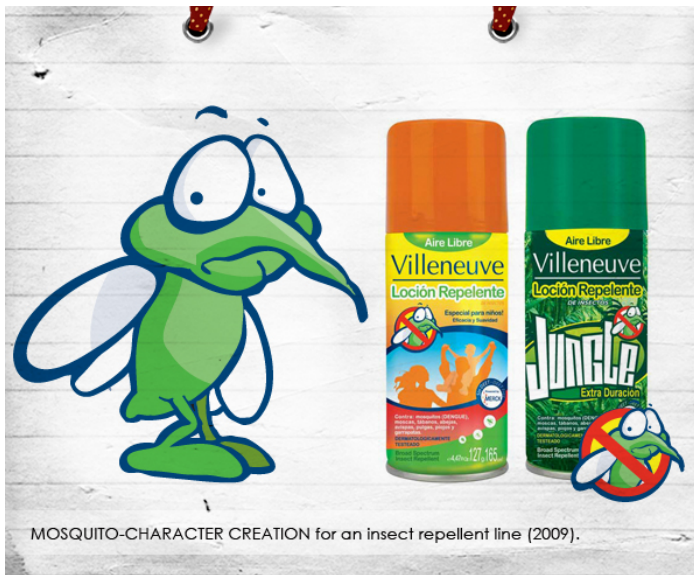
MOSQUITO-CHARACTER CREATION for an insect repellent line (2009).

Please kindly get in touch for portfolio works.