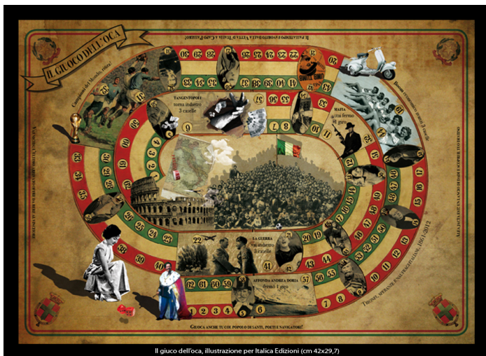
Il gioco dell'oca, Illustrazione per Italcas Edizioni (cm 42x29,7)