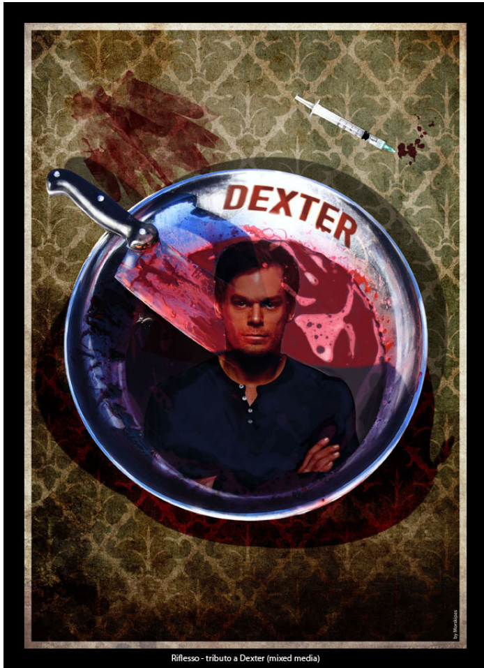
Riflesso - tributo a Dexter (mixed media)

View the full portfolio at http://www.thecreativefinder.com/battara